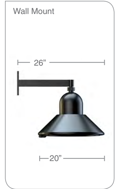
GC6020 / WB16