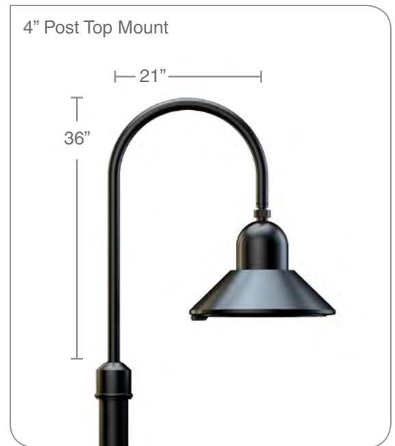
GC6020 / CP136