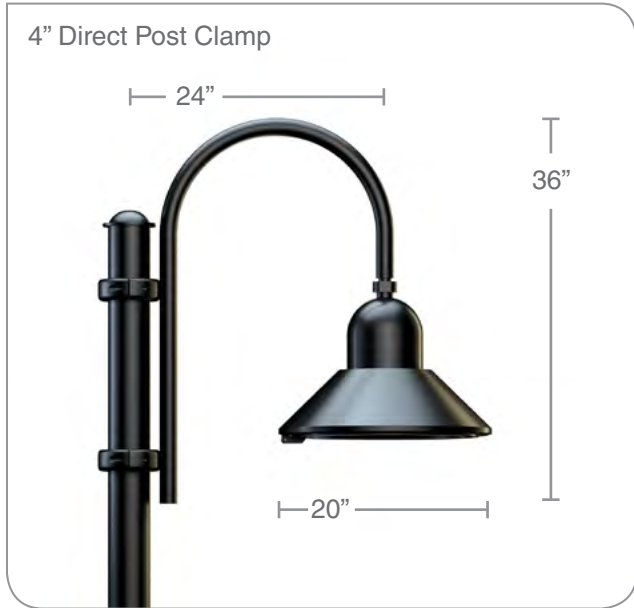
GC6020 / CP136P

All Aluminum components are used to reduce weight without compromising strength and stability. Stainless Steel hardware is included.