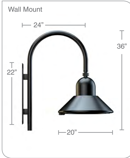
GC6020 / CW36